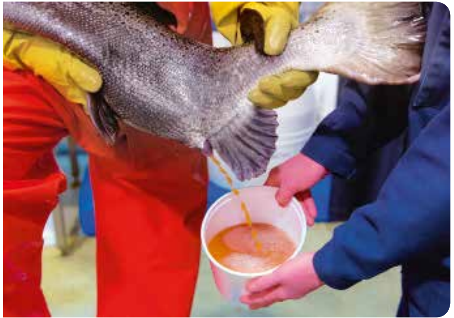
The process starts with male and female broodstock which are carefully selected to produce the highest quality milt (sperm) and eggs.

Consumers should ask themselves the question, "Who funds a two decade long marketing campaign costing billions of dollars without an expected economic benefit at the end of it all?"