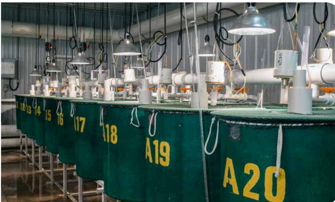
The company aims to produce 10 million AquaAdvantage salmon eggs a year from a refurbished former smolt facility on PEI.

“Land-based salmon farming, originally considered as a means to keep genetically engineered salmon from escaping, now appeared to solve a number of climate change problems.”