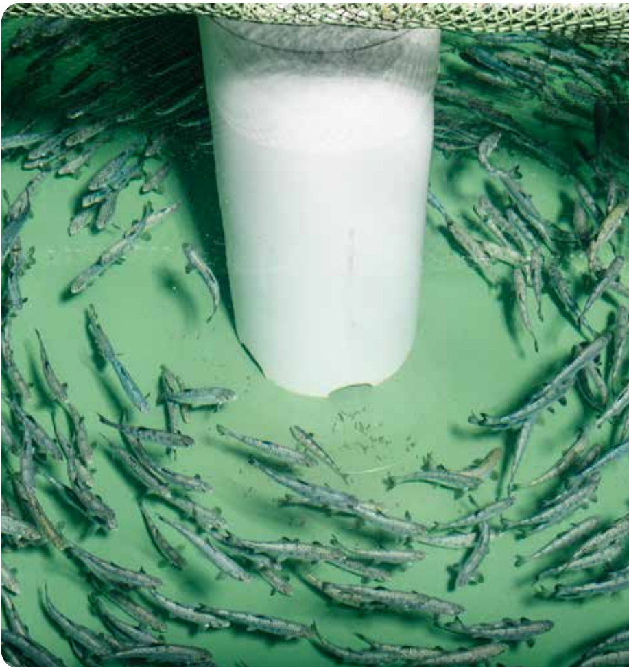
Juvenile AquaAdvantage salmon

Having obtained FDA approval in November 2015 to commercialize AAS for human consumption in the USA, and more recently Health Canada approval in May 2016 for production and consumption in Canada, AquaBounty is preparing to scale-up for commercial production. The company completed the acquisition of the former Atlantic Sea Smolt hatchery in Rollo Bay, PEI in June 2016 in order to guarantee its supply of conventional Atlantic salmon eggs. Unused since 2013, the facility is now being renovated and will have the capacity to produce 10 million