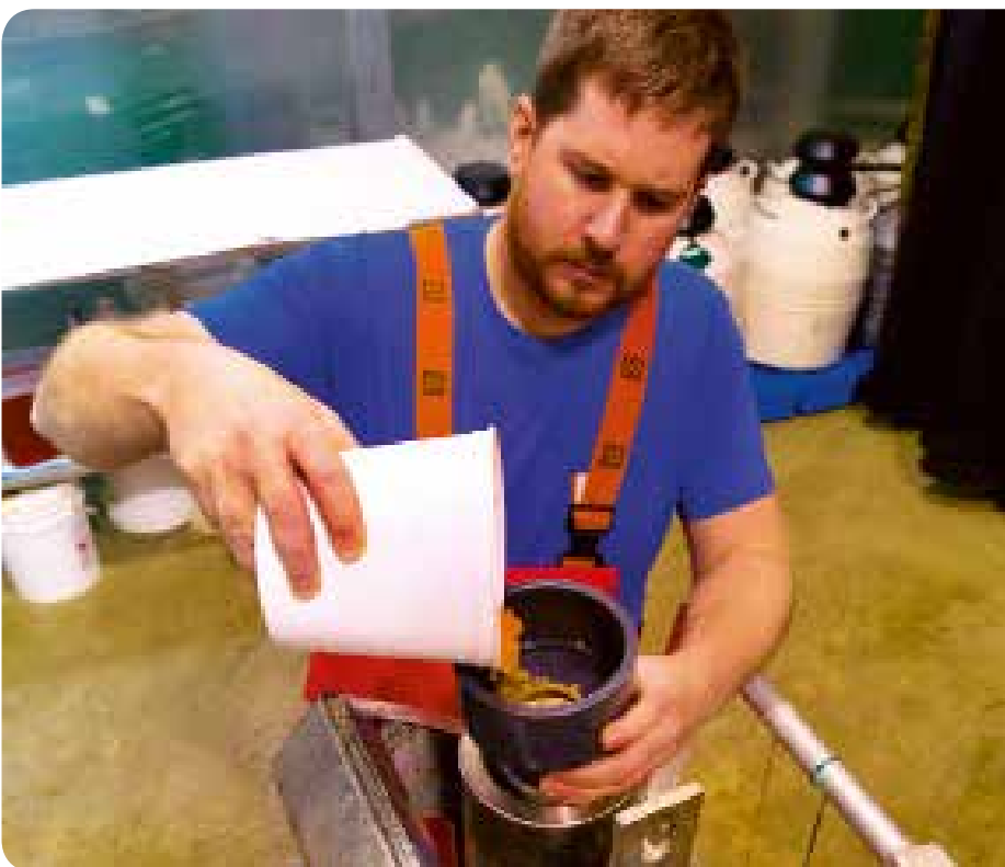
The fertilized AAS eggs are then pressure shocked to induce sterility, making the fish produced from these eggs unable to reproduce.

In contrast to North America, the barrier to consumer/market acceptance in the EU is a social/cultural barrier rooted in the Common Agriculture Policy history and economic support for small producers. Price supports are the underlying basis for EU policy in agriculture. This, coupled with a rejection of molecular genetics applied to food production in some countries, makes the EU inhospitable to AAS.