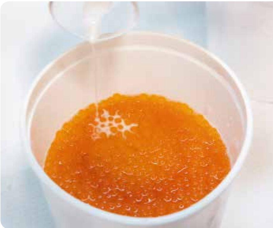
The resulting combination of the non-transgenic conventional Atlantic salmon eggs and the AAS milt is fertilized AAS eggs. Using these methods, AquaBounty Technology's breeding program has successfully produced ten generations of AquaAdvantage® Salmon at the Company's breeding hatchery in Canada.

The controversy over GMO foods is manufactured for economic gain; it is not based on science. In fact, all of the major national and international science bodies have concluded from their numerous studies over the past two decades that foods developed from the application of precision breeding technologies are as safe to consume as their conventionally produced equivalents.