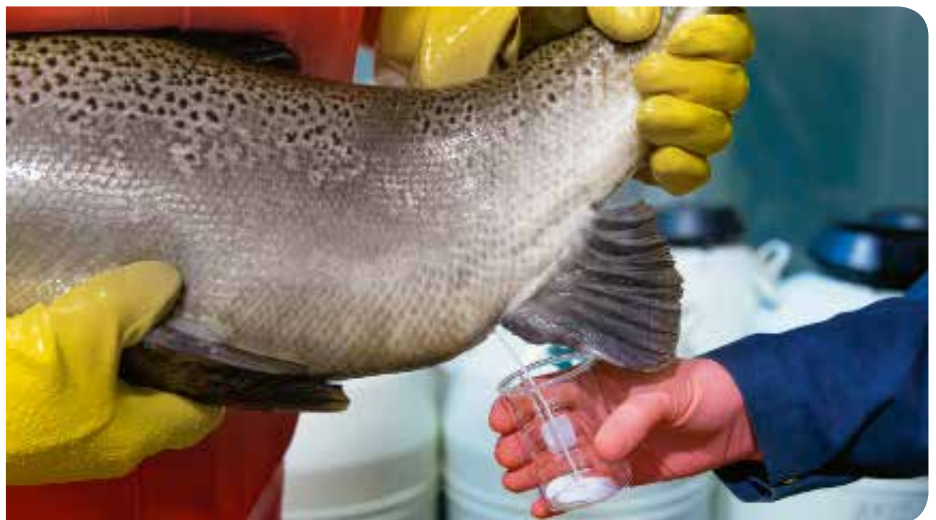
To those green eggs is added milt that has been extruded from male Atlantic salmon that carry the AAS transgene enabling fast growth. This transgene is a permanent part of the male's genome and is heritable, meaning it is passed naturally from one generation to the next.

The female broodstock is comprised of superior lines of non-transgenic conventional Atlantic salmon which, when fully mature, are gently massaged to extrude the unfertilized (also known as "green") eggs.